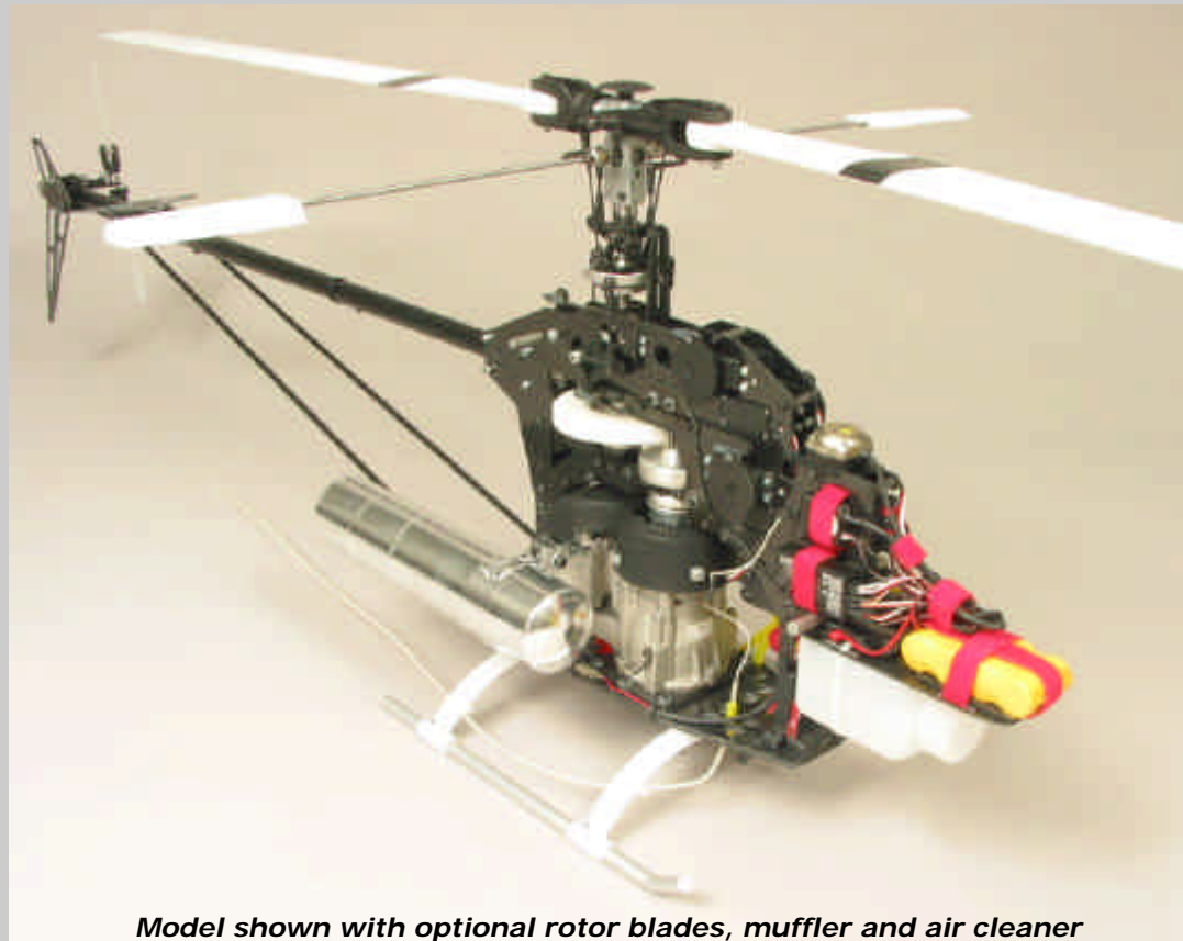
Model shown with optional rotor blades, muffler and air cleaner

Miniature Aircraft produced the first gasoline powered aerobatic helicopter nearly 15 years ago. Now we're ready to produce the most aerobatic and versatile gasoline model available anywhere. If you believe that gasoline helicopters aren't suited for today's radical 3D flying styles, its time to change your mind.